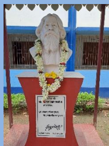
Rabindra Jayanti, 2024